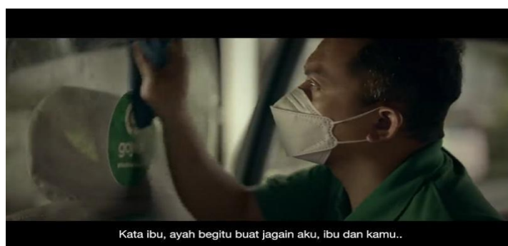
Figure 5 Scene 5 of Gojek Adv