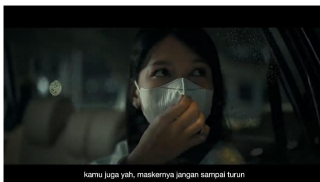
Figure 7 Scene 7 of Gojek Adv

Scene 7 uses the Eye Level shooting technique with a Big Close Up image size, because this scene shows the detail of the customer object that shows the correct use of the mask, by raising the mask according to the recommendation.