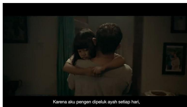
Figure 8 Scene 8 of Gojek Adv

Scene 7 uses the Eye Level shooting technique with a Big Close Up image size, because this scene shows the detail of the customer object that shows the correct use of the mask, by raising the mask according to the recommendation.