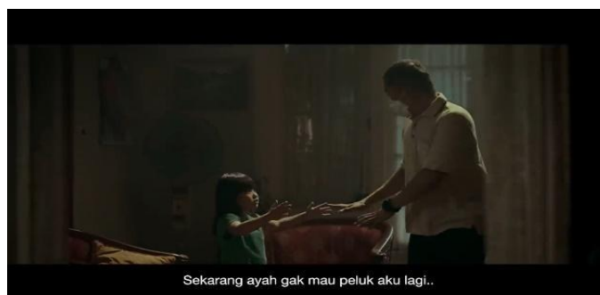
Figure 1 Scene 1 of Gojek Adv