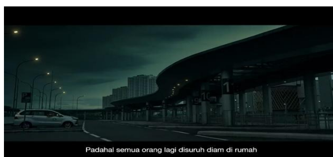
Figure 3 Scene 3 of Gojek Adv

In scene 2 uses the Eye Level shooting technique with a Long Shot image size or a full object with a background, which means highlighting the object against the background. Gives a clearer picture of the object. Shows the activity of the child playing cooking and inviting the father who just came home from work with a happy face, but suddenly sad because the father refuses the child's invitation to play together.