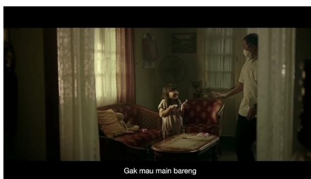
Figure 2 Scen 2 of Gojek Adv

In scene 1, the shooting technique is done with the Eye Level technique with a Medium Shot image size, because in this scene it shows 2 objects, namely the child and father by showing the size of the Long Shot image so that the child and father are seen in the frame, by hinting a father who refuses to be hugged by a child.