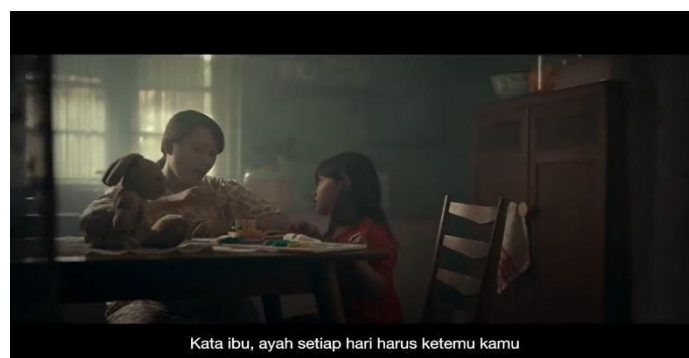
Figure 4 Scene 4 of Gojek Adv

the sky which is already showing the evening time which means that the father is working from morning to night to make ends meet his family. While the atmosphere depicted in the scene seems quiet and there is only a car carrying the father, which implies that during a pandemic, people are encouraged to stay at home to avoid transmitting the virus. By limiting gatherings and avoiding crowds, maintaining cleanliness, and implementing health and safety protocols.